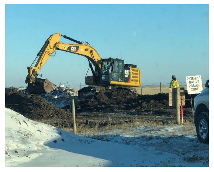
STRIPPING TOP SOIL FROM ACCESS ROAD.